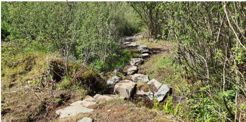
Crossing a burn on the route to Dun Chibhich

June might have seemed a quiet month in terms of Gateway activity but be assured that things have been ticking along behind the scenes. Our Phase 2 paths are well advanced now, though none is 'officially' complete. But most of the necessary steppingstones and stone pitching are in place. One notable exception is at the top of Dun Chibhich, where on-site guidance by Historic Environment Scotland and Argyll Archaeology will be followed to ensure the integrity of this important ancient monument is preserved.